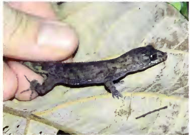
Fig. 9. Nactus cf. pelagicus from Salibabu Island.

Morphology: SVL 54 mm; tail regenerated, 55 mm long, fifth toe of left hind limb missing; probably a female, pre-anal pores missing; dorsum, limbs and tail (except for regenerated part) covered with granules and conical tuber-